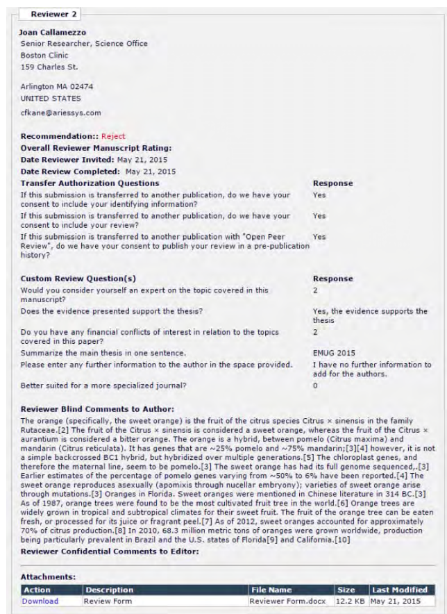
Figure 3. Sample components of a review to be transferred.

Once transfer is enabled, a publication can continue to add transfer partners, should additional publications need to participate. New custom fields will also be incorporated into transfers as they are added to a publication’s configurations. Administrators can take care to match these new fields to existing fields in other publications using custom meta identifiers, and are free to move and reuse these identifiers as custom fields are changed or discontinued.